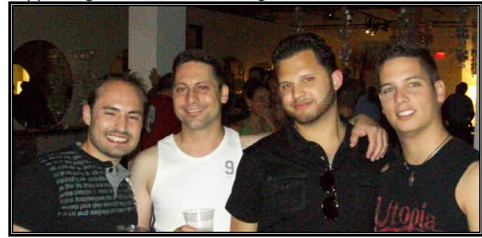
Revelers enjoy the evening at Takeover Fundraiser for FACT

A Beach Party took place in Bethlehem as TAKEOVER converted American Hairlines, Bethlehem, into a tropical paradise! The event sponsored by TAKEOVER and assisted by FACT took place on June 19, 2009. A scrumptious buffet along with wine and beer greeted guests who made a $15. donation to FACT. A 50/50 raffle was also held through the night and proceeds donated to FACT. FACT is grateful to TAKEOVER and to American Hairlines for providing this great opportunity for FACT to not only raise funds, but also to make people aware of who FACT is and the importance of supporting our all volunteer organization.