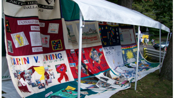
AIDS Memorial Quilt Displayed during the FACT Summer Games.