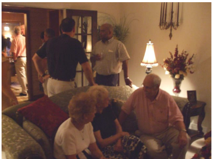
Attendees enjoying the pre-dinner conversation in the parlor.